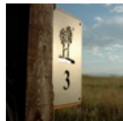
Breakfast Club Saturdays

Meet at the practice tee at 7:30 a.m. choose foursomes and go play golf.