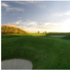
Men's Club Wednesdays

12:30 shotgun start Bring $20 for cash game Lunch available at 11:30