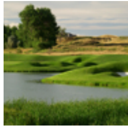
Women's Club Thursdays

12:30 shotgun start Bring $20 for cash game Lunch available at 11:30